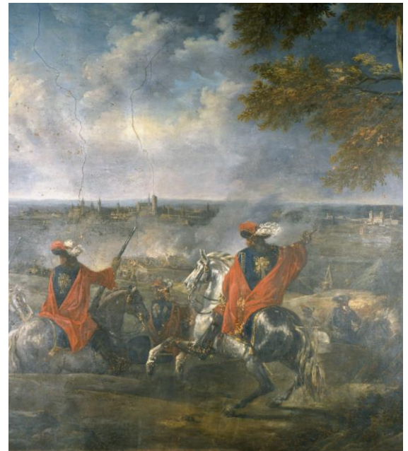
Mural painting representing the taking of Gheint, by Jozeph Parrocel. Paris, Musée de l'Armée