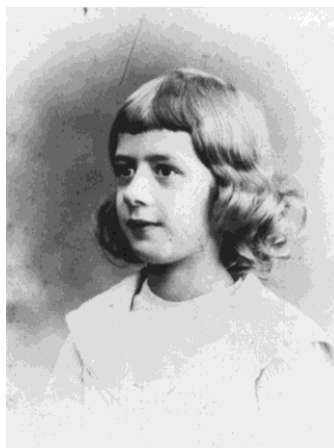
Charles de Gaulle, aged 7