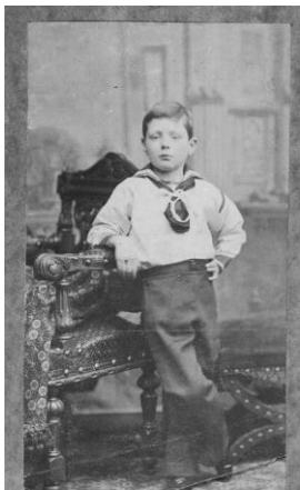
Winston Churchill in 1881, aged 7

Like for any other Musée de l'Armée exhibition, interactive and special panels punctuate the exhibition so that children, from 9 years' old, can explore the major themes relating to Churchill and de Gaulle. In this way, they will have the reading keys to discover and decipher the objects, posters or archives displayed. Furthermore, they will be offered a game book and guided tours.