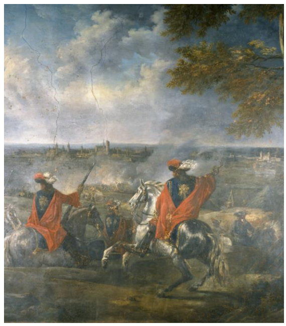
Mural painting representing the taking of Gehnt, by Jospeh Parrocel. Paris, Musée de l'Armée